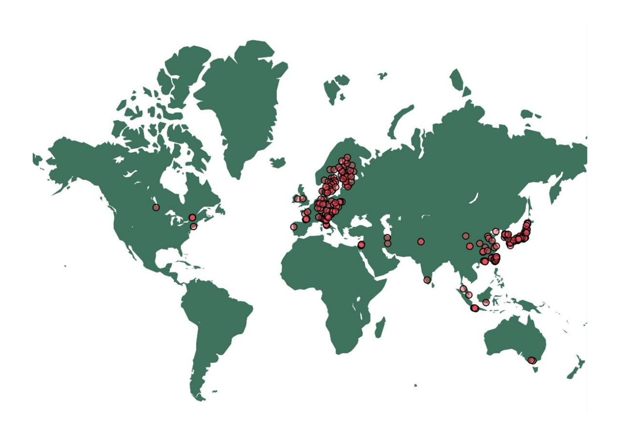
Figure 1: Location of HPH members

The International Network of Health Promoting Hospitals and Health Services (HPH) was founded on the settings approach to health promotion as a response to the WHO Ottawa Charter for Health Promotion action area, 'reorienting health services' (5). WHO inspired a movement by initiating an international network of national and sub-national networks that supported the implementation of this concept (6). The whole-of-system approach of HPH produced action that brought several health reform movements together: patients' or consumer rights, primary health care, quality improvement, environmentally sustainable ("green") health care and health-literate organizations. The organizational development strategy of HPH involved reorienting governance, policy, workforce capability, structures, culture, and relationships towards health gain of patients, staff, and population groups in communities and other settings. As of 2020, the HPH network consists of more than 600 hospitals and health service institutions from 33 countries.